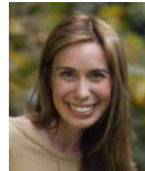
Mireya Mayor Biologist