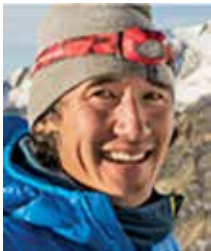
Jimmy Chin Photographer and Filmmaker